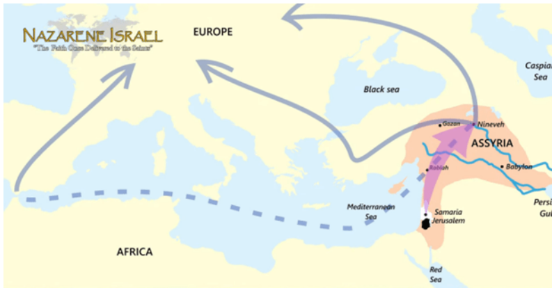
The Assyrians take the Israelites captive (734-732 BC and 724-721 BC) → Israel scatters and blurs in the world

That is why, starting around 722 BCE, Yahweh sent the Assyrians to take the Ephraimites into both physical and spiritual captivity in what is called the Assyrian captivity (or dispersion); in which Yahweh allowed this scattering to take place so the northern House of Israel or Ephraim might be mixed into the world like seed, thus fulfilling the prophecies given to the patriarchs. That every family, and every nation and every clan would have their genetics.